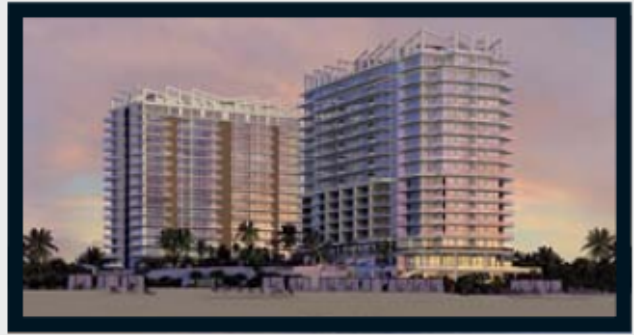
Barot hopes guests find a 'roadmap to wellness' at Amrit

Practitioners will focus on preventative maintenance and personalised wellness. Tower P (Peace) will be a resort residential tower with features such as posture-supportive